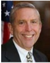
Rep. Buddy Harden